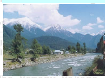
BEAS RIVER VEIW